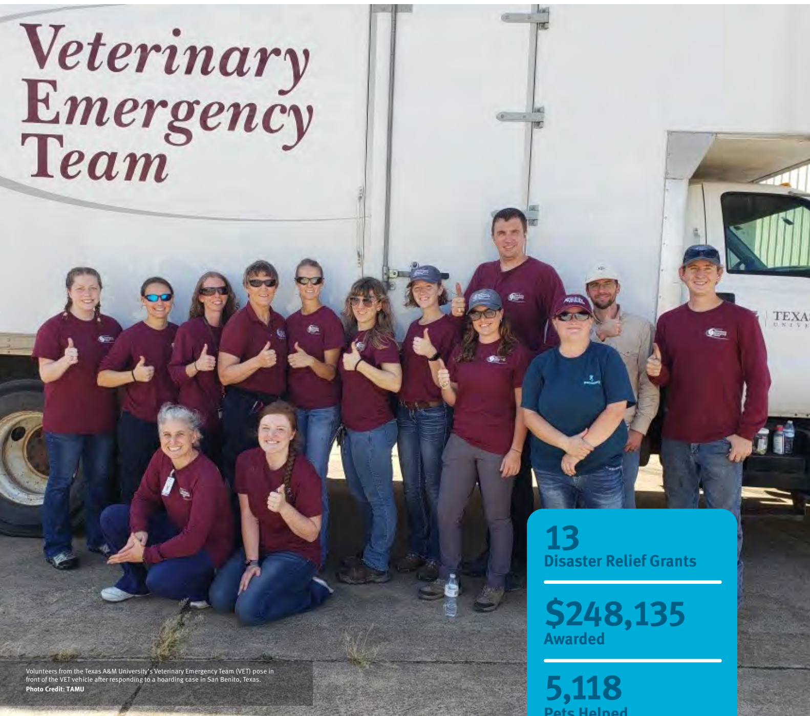
Volunteers from the Texas A&M University's Veterinary Emergency Team (VET) pose in front of the VET vehicle after responding to a hoarding case in San Benito, Texas.

13 Disaster Relief Grants $248,135 Awarded 5,118 Pets Helped