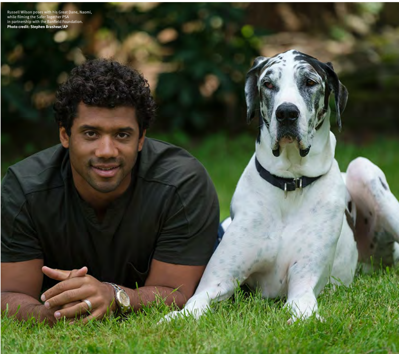
Russell Wilson poses with his Great Dane, Naomi, while filming the Safer Together PSA in partnership with the Banfield Foundation.