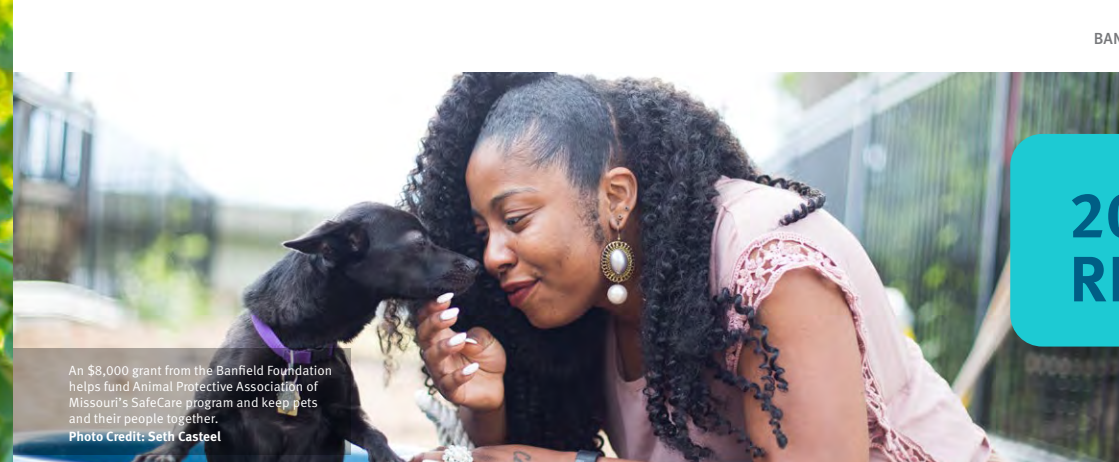
An $8,000 grant from the Banfield Foundation helps fund Animal Protective Association of Missouri's SafeCare program and keep pets and their people together.